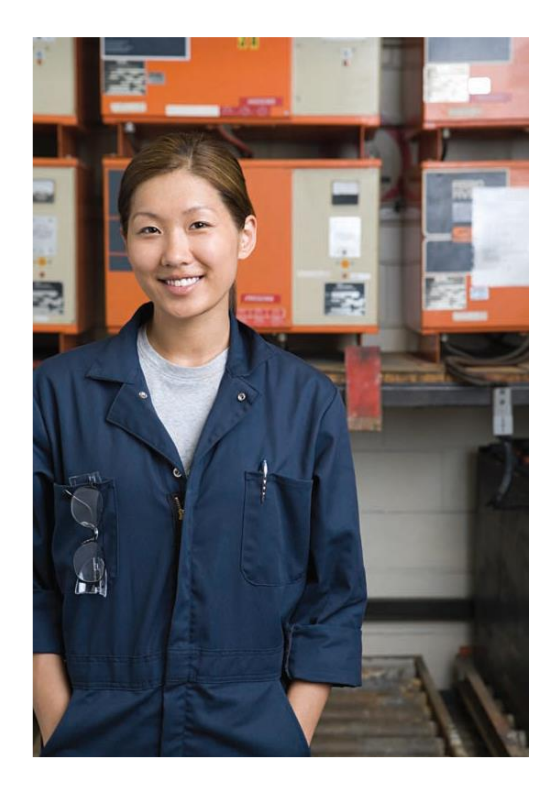
In conjunction with: US Department of Heath and Human Services Health Resources and Services Administration