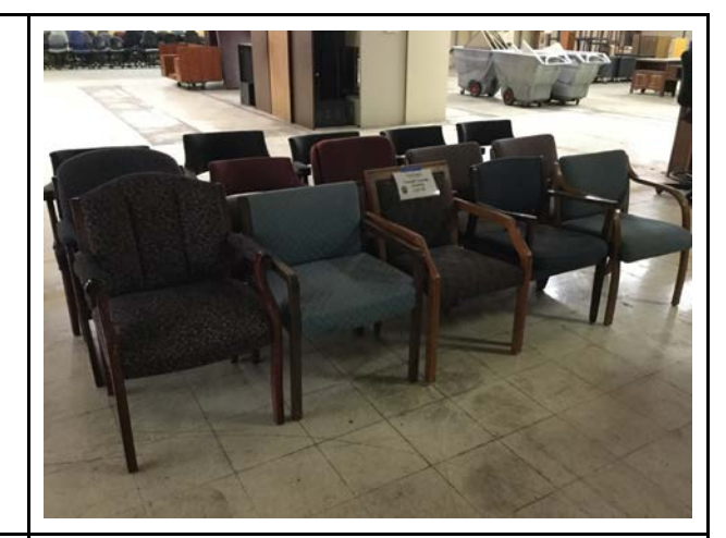
Lot 37- Various Cloth Office Chairs