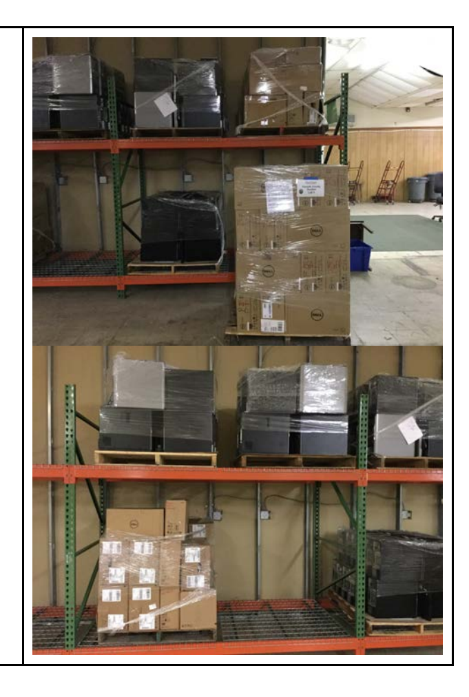
Lot 1- Pallets of Computers

Disclaimer: Images below do not depict exact quantities of items in each lot.